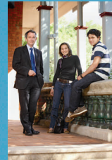
North Sydney (Mackillop)