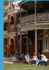
Strathfield (Mount St Mary)