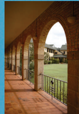
Brisbane (McAuley at Banyo)

Our six campuses are located in the state capital cities of Melbourne, Sydney, and Brisbane, the national capital, Canberra, and the regional centre of Ballarat. Each campus has its own unique environment, in either a city or suburban location: