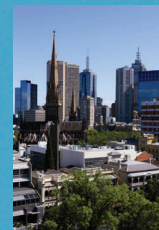
Melbourne (St Patrick's)